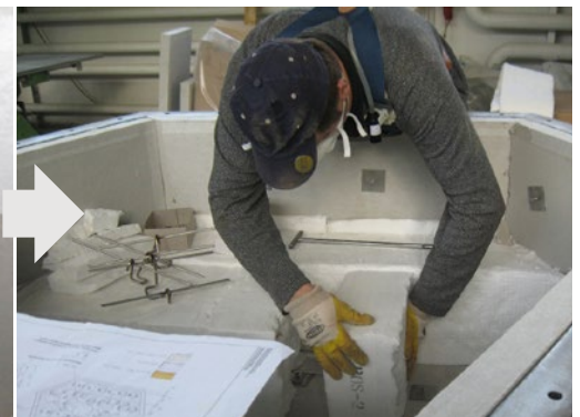
Fig. 12: Press module onto pins