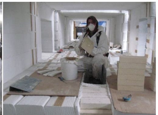
Fig. 8: Cement refractory bricks

HTIW installation is generally a high exposure activity. The application of relevant health and safety measures during installation is required, especially personal respiratory protection with P3 filter, and protective clothing . Blankets and modules should be handled carefully. If possible, pre-fabricated modules/blanket pieces should be used, and a sharp blade used if cutting is required. The off-cuts must be handled gently and carefully placed into plastic bags and sealed. All materials for disposal must be kept in a segregated area in sealed and labelled bags. A mobile HEPA-vacuum cleaner with appropriate accessories and fittings is the preferred method for removing fibrous dust from module surfaces and for cleaning the work station.