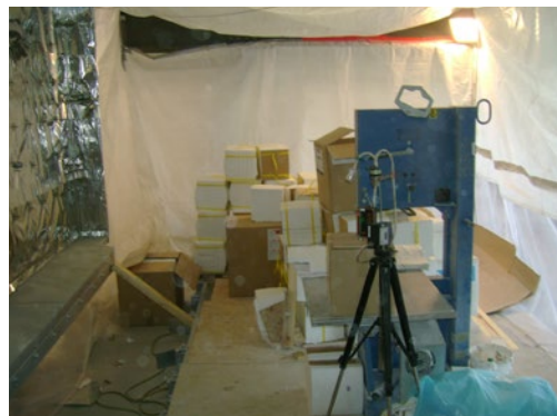
Fig. 1: Enclosed work area with filter system