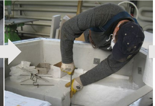
Fig. 10: Fix anchor system