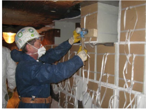
Fig. 5: Installation of prefabricated modules