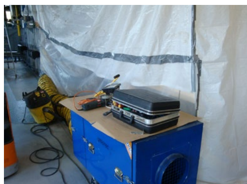
Fig. 3: Negative pressure enclosure – air cleaner with HEPA filter