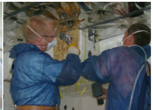
Fig. 2: Installation in the work area