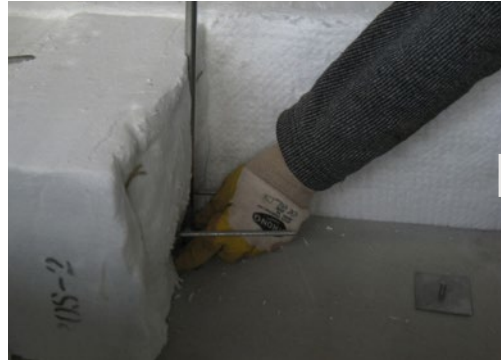
Fig. 9: Attach metallic comb-anchor