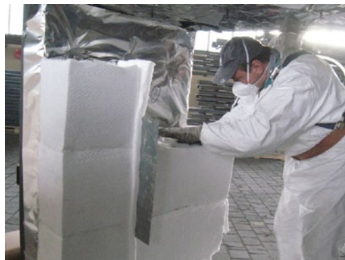
Fig. 7: Installation of blankets and modules