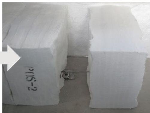
Fig. 11: Installation of the next module