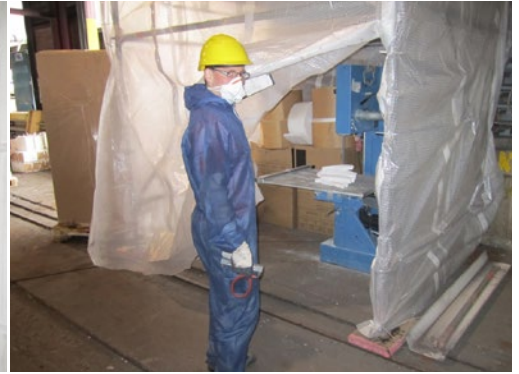
Fig. 6: Enclosed saw