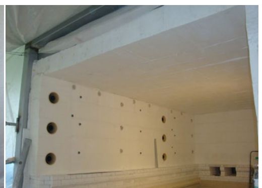
Fig. 4: After installation - industrial furnaces (with modules and bricks)